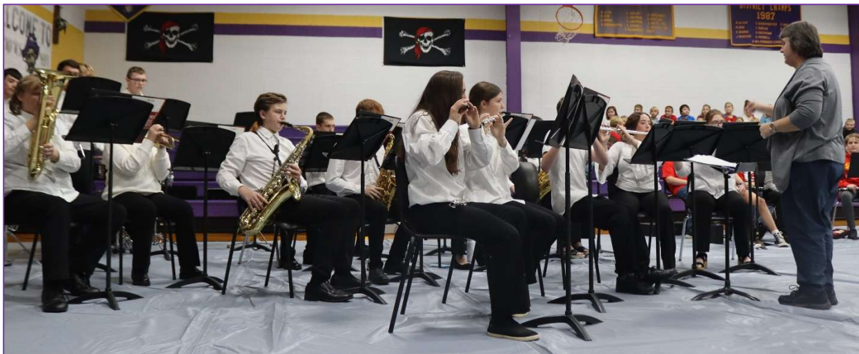
The high-school band plays the "U.S. Armed Forces Salute."