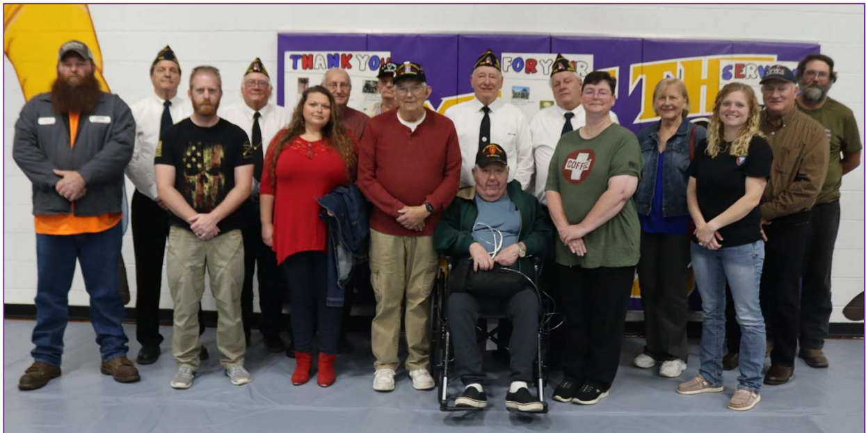
Veterans in attendance take time for a group photo after the CHS Veterans Day program on Friday, Nov. 10.

then. As the video played, Steffen shared many memories and interesting information with the audience, all while cracking jokes.