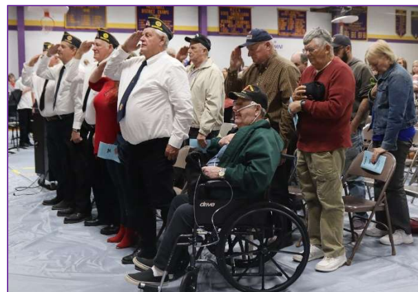
Veterans salute during the moment of silence and playing of "Taps."

Follow Us on Social Media Facebook: Osage County R-1 Schools Instagram: Chamois Pirates