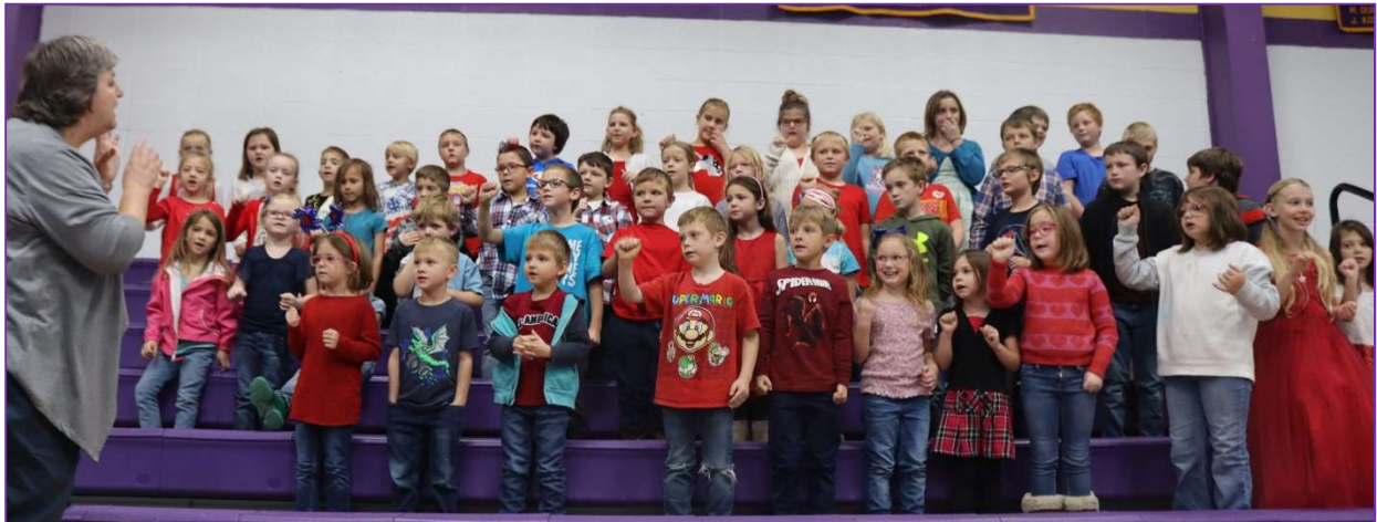
Elementary students sing a tribute to the veterans during the program.