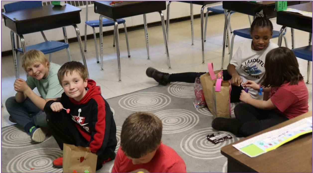
Third graders watch a movie while they enjoy their Valentine's Day party.